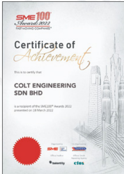
SME100 Awards 2022 (Fast Moving Companies)

We have also proudly achieved the ISO 9001:2015 and CIDB G7 certifications which indicate our competency and ability to meet industry standards and expectations from our company and services.