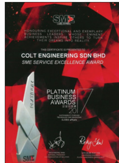
SME Business Platinum Awards 2017 (SME Service Excellence Award)