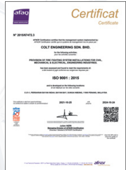
ISO 9001 : 2015