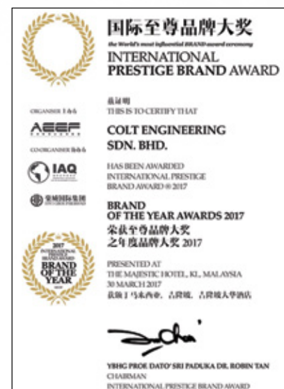
Brand of the Year Awards 2017 (International Prestige Brand Award)