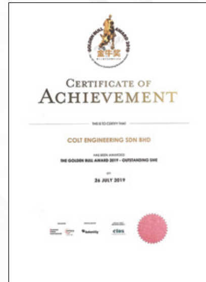
Golden Bull Award 2019 (Outstanding SMEs Award)